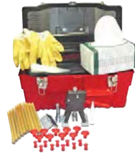
Dent Lifter Kit

Reduce outsourcing and keep revenue in-house with WURTH USA's Paintless Dent Repair Kit. Let the Mini Lifter Kit pay for itself by providing a highly cost-effective dent repair solution to your customers.