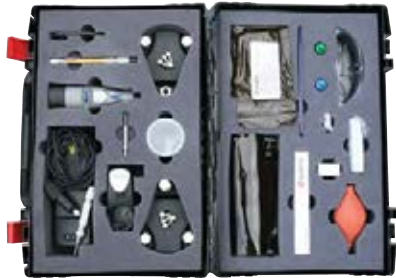
Windshield Repair Kit

Repair bull's-eyes, star breaks and combination breaks in-house to reduce glass repair costs and increase Customer pay Labor and parts. A free instructional video is included with the purchase of the kit.